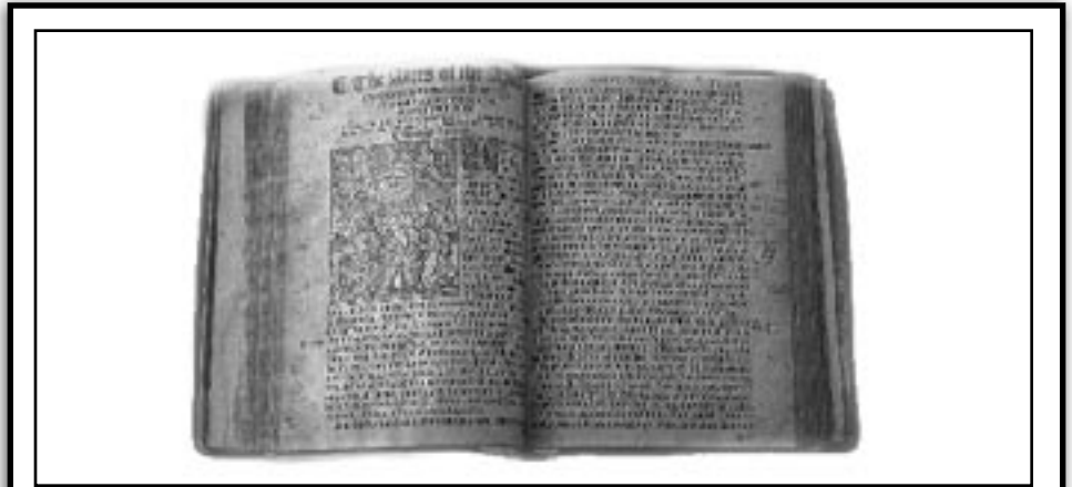
Tyndale Bible. Although it's often taken for granted now, the Bible has been a frequently suppressed book in ages past. In 1525, William Tyndale tried to share this treasure with others by publishing a New Testament written in English. In 1536, after being hunted down and imprisoned, he was strangled and burned at the stake for his efforts.

“The word of the Lord endureth for ever. And this is the word which by the gospel is preached unto you.” (1 Peter 1:15)