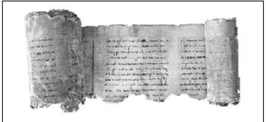
A Dead Sea Scroll containing the Old Testament book of the prophet Isaiah.